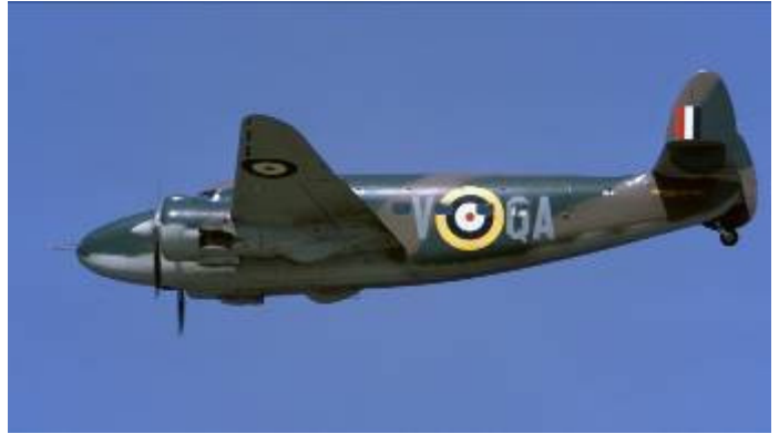
1940 Lockheed C60 Lodestar

We staged through Tel Aviv Habbaniya [Iraq] Shaibah near Basra [Iraq] Bahrain and Sharjah [UAE]. Then a long haul across the Arabian sea to Karachi then on the Allahabad, where we left the aircraft.